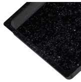
Enameled GN container