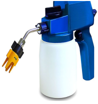
Vision Oil Spray Gun