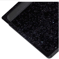
Enameled GN container