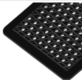
Vision Express Grill