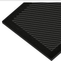
Vision Grill Diagonal