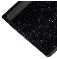
Enameled GN container