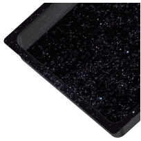
Enameled GN container